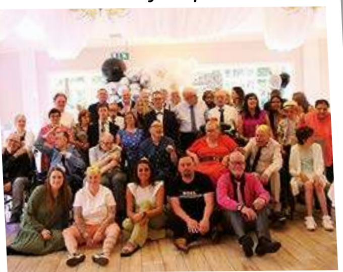
Everyone say 'party-time!'

It was such a wonderful evening, and everyone ended the night with a group photo to make the memory last forever.