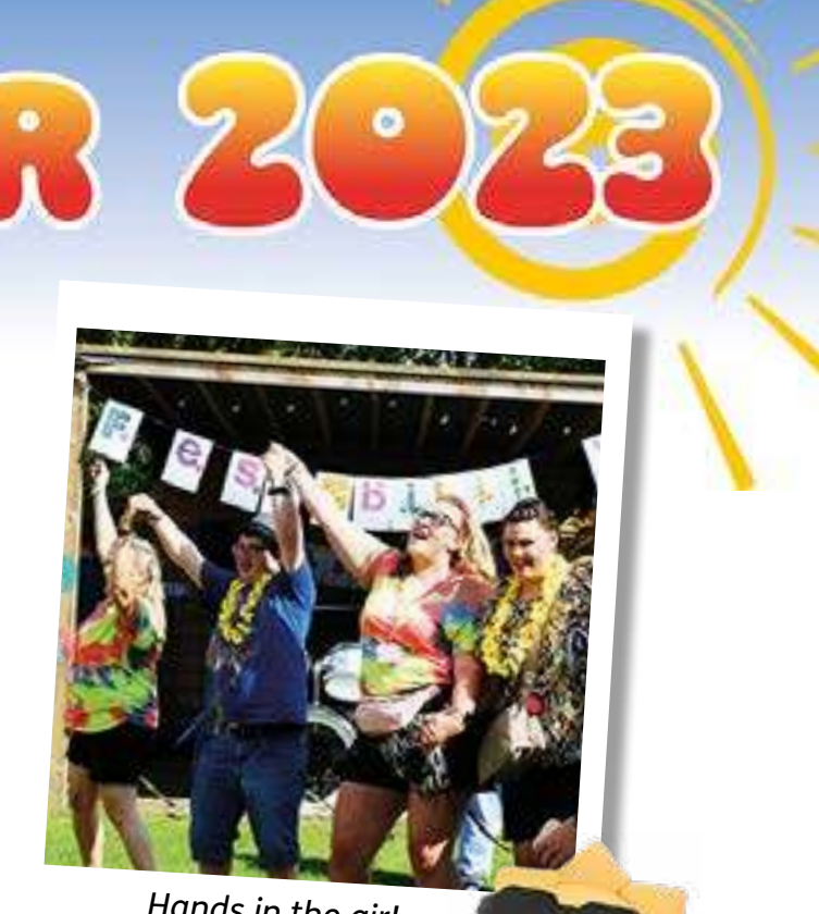
Hands in the air!