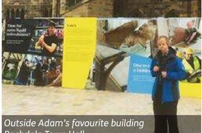
Rochdale Town Hall.

Do you have a favourite place? Let us know by getting in touch with communications@creativesupport.co.uk