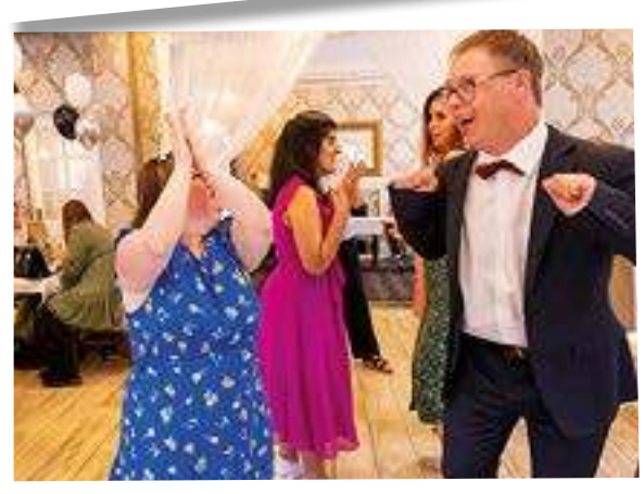
Dancing the day away!